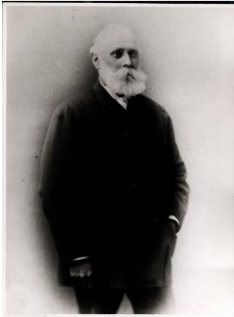
Maximilian von Brandt in 1892