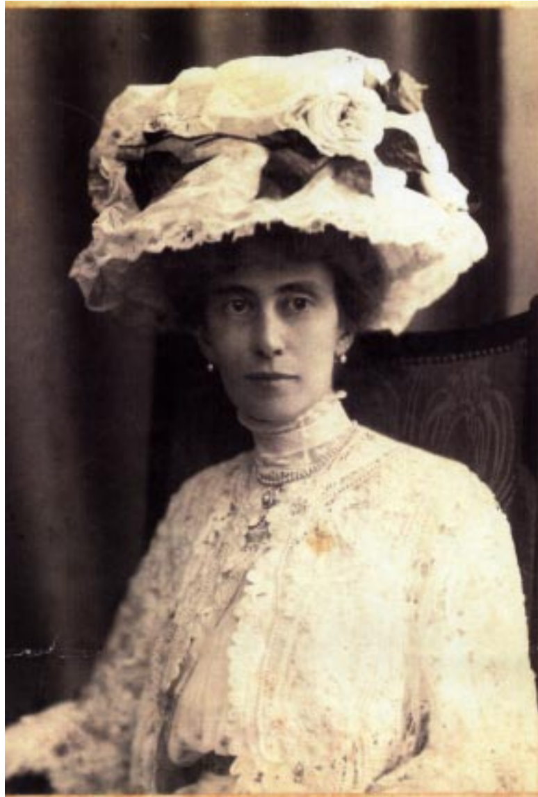
Max in 1908 in Weimar